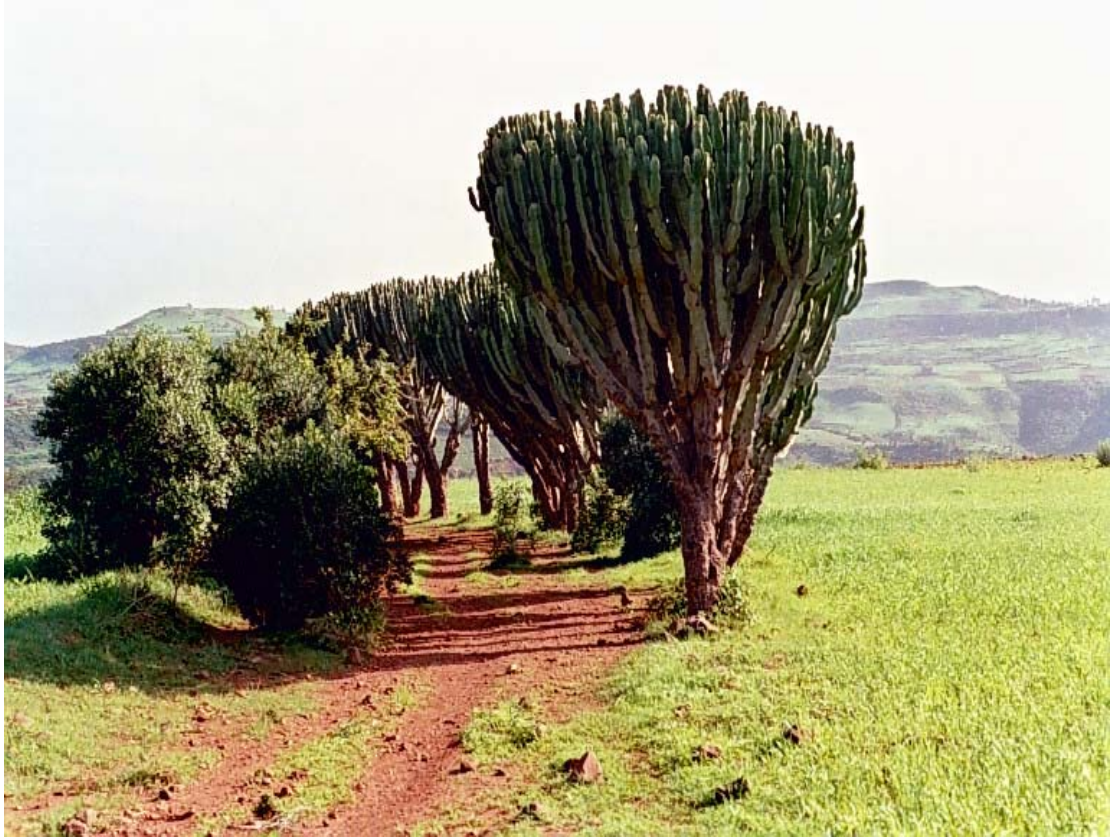
Remnants of an evil eye protection hedge, Shimela Maryam, ANRS.